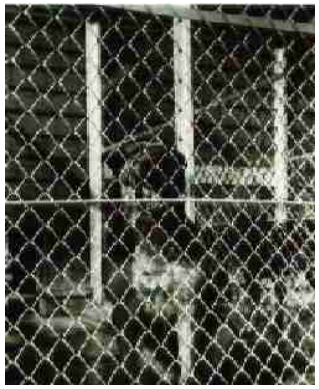
Showa's Dog Kennels and Lady F-433

And on March 13, 1953, construction of a new kennel building with thirty attached steel runs was started; twelve days later, on March 25, 1953, another new contract for the purchase of three hundred fifteen additional dogs was entered into with the "All Japan Shepherd Dog Association."