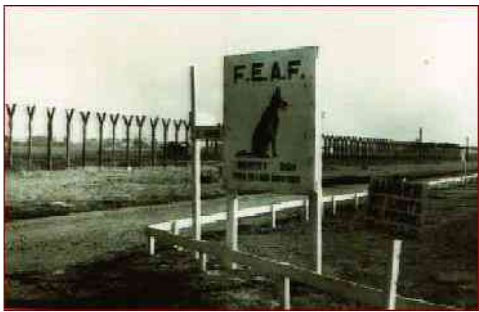
The FEAF Sentry Dog Training Center, Japan 1952

The first Air Force Sentry Dog School was activated on March 10, 1952 at Far East Air Forces (FEAF) Showa Air Station, Japan