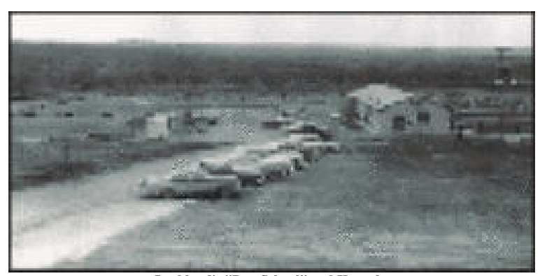
Lackland's "Dog School" and Kennels.

Sensing it was time to take matters into its own hands, the United States Air Force on October 20, 1958, established the Sentry Dog Training Branch of the Department of Security Police Training at Lackland AFB, near San Antonio, Texas.