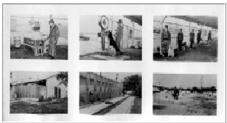
Scenes From Lackland's Dog School, Mid 60s

The dog candidates were given examinations on the spot, and most were purchased for $150 on average. The US Army for awhile considered doing the same thing, but quickly realized, that it was cheaper to just purchase whatever dogs they needed from the Air Force ...for only $175.