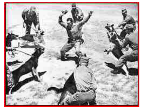
"Get Him." cried the handlers.