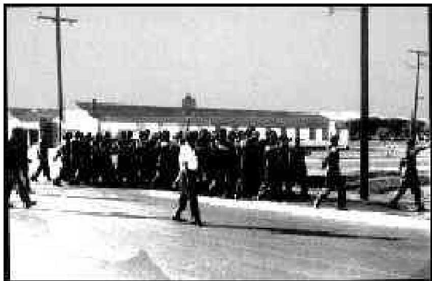
Lackland AFB Basic Training Center

In June 1964, the Air Force relieved the Army Quartermaster Corps of procuring all "live animals not raised for food" ...the Air Force would now purchase their own dogs, and train them at their new school at Lackland.