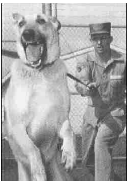
Lackland Sentry Dog School, Bldg 1130

They were one handler dogs, unlike the patrol and messenger dogs from WW II; they were a valuable tool in the US Air Force resource protection plan, but their use was limited to restricted, and isolated area.