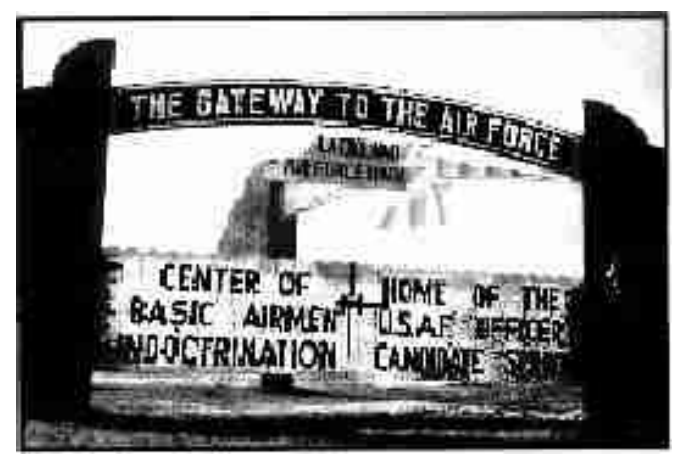
Lackland: The Gateway To The USAF

By February 1962, a shortage still existed, with another urgent appeal by the Quartermaster Corp for 560 dogs and then an additional 1,700 shepherds during the later part of '62. The QMC fell well short of this goal; it purchased only 524 dogs and received another 92 through donations.