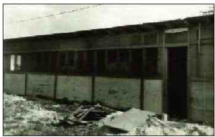
Kennel Building Construction Was Started March 1953

The handler's training was for anywhere between two or three weeks, depending upon the handler's attitude and abilities.