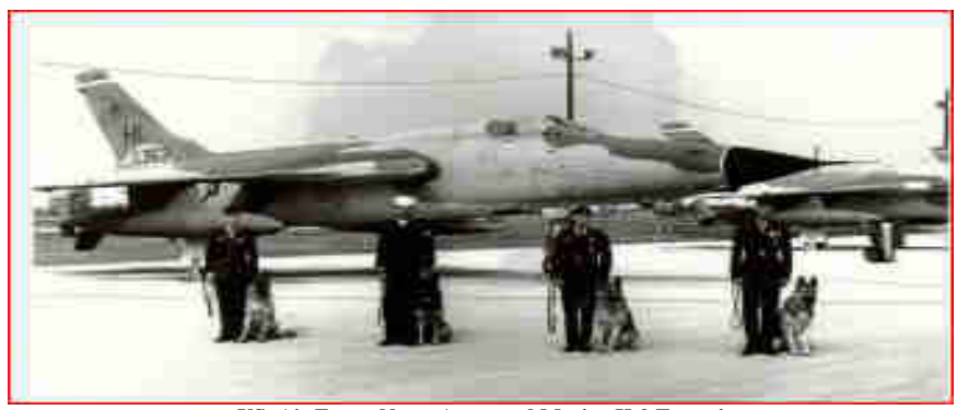
US: Air Force, Navy, Army and Marine K-9 Teams!