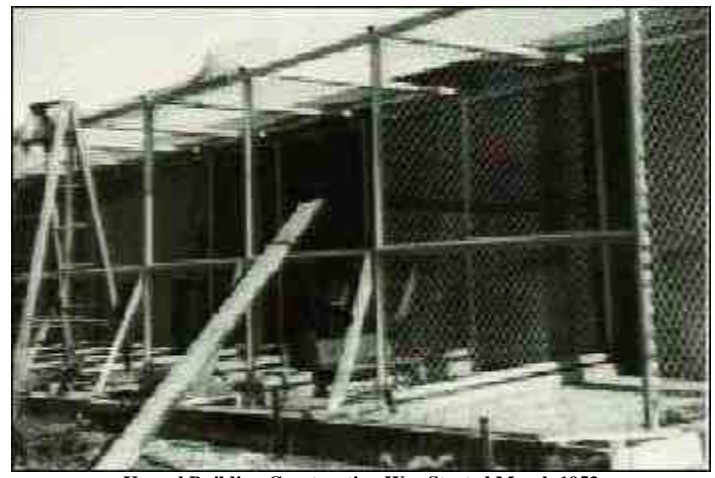
Kennel Building Construction Was Started March 1953